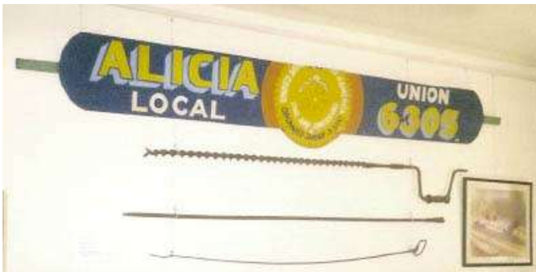
Figure 4: Local Union 6305, Alicia, PA