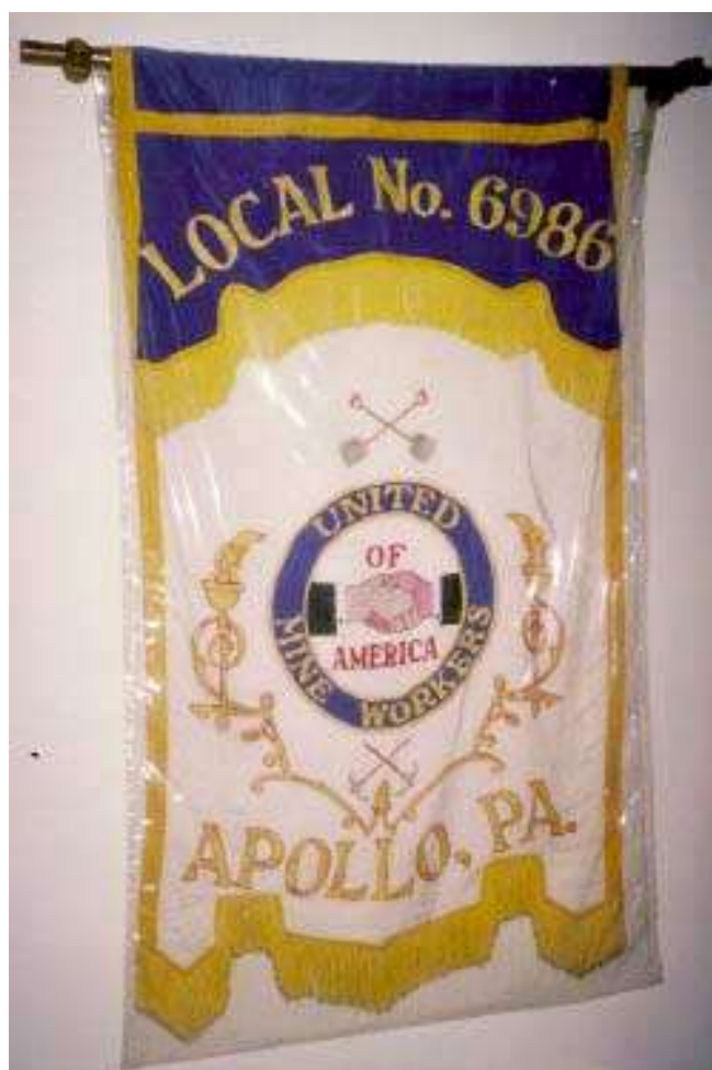
Figure 2: Local No. 6986, Apollo, PA