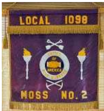
Figure 1: Local No.1098, Moss No. 2, Moss, WV

Banners have long been a way of announcing organizational affiliation. The earliest known examples of banners, at least if we believe Hollywood, were used in the days of the Roman Empire. In more recent times universities, public schools, fraternal organizations, police, firemen, and political parties have carried banners at parades, or hung them on the wall at meeting places to show solidarity. Unions were no different and the United Mine Workers of America (UMWA) and the International Union of Mine, Mill, and Smelter Workers (IUMMSW) used them.