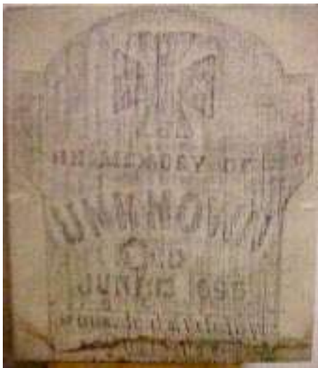
IN MEMORY OF UNKNOWN DIED JUNE, 13 1895 (Wadsworth, Nevada cemetery)