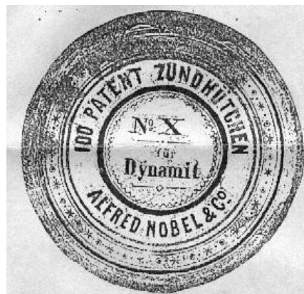
ALFRED NOBEL, No. X, ZUNDHUTCHEN

Paper label with black letters on white paper. Reported by Robert Hauck.