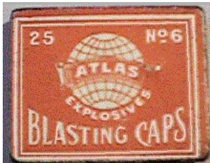
ATLAS, No. 6, 25 caps.