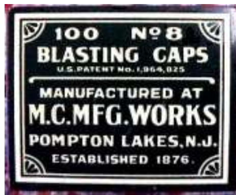
METALLIC CAP, No. 8, N.J., U.S. PATENT