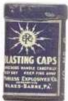
PEERLESS, 10 caps.