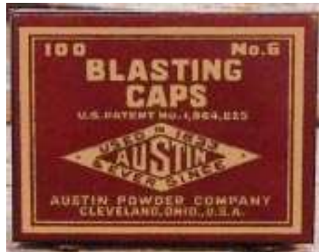
AUSTIN, No. 6, U.S. PATENT Reported by Graham Living.