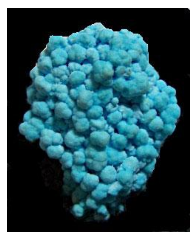
Turquoise, 2.5 cm, from the Mineral Park mine, Kingman, Arizona.