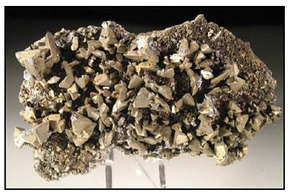
Tennantite, 11.1 cm, from the Julcani district, Angaraes Province, Huancavelica Department, Peru.