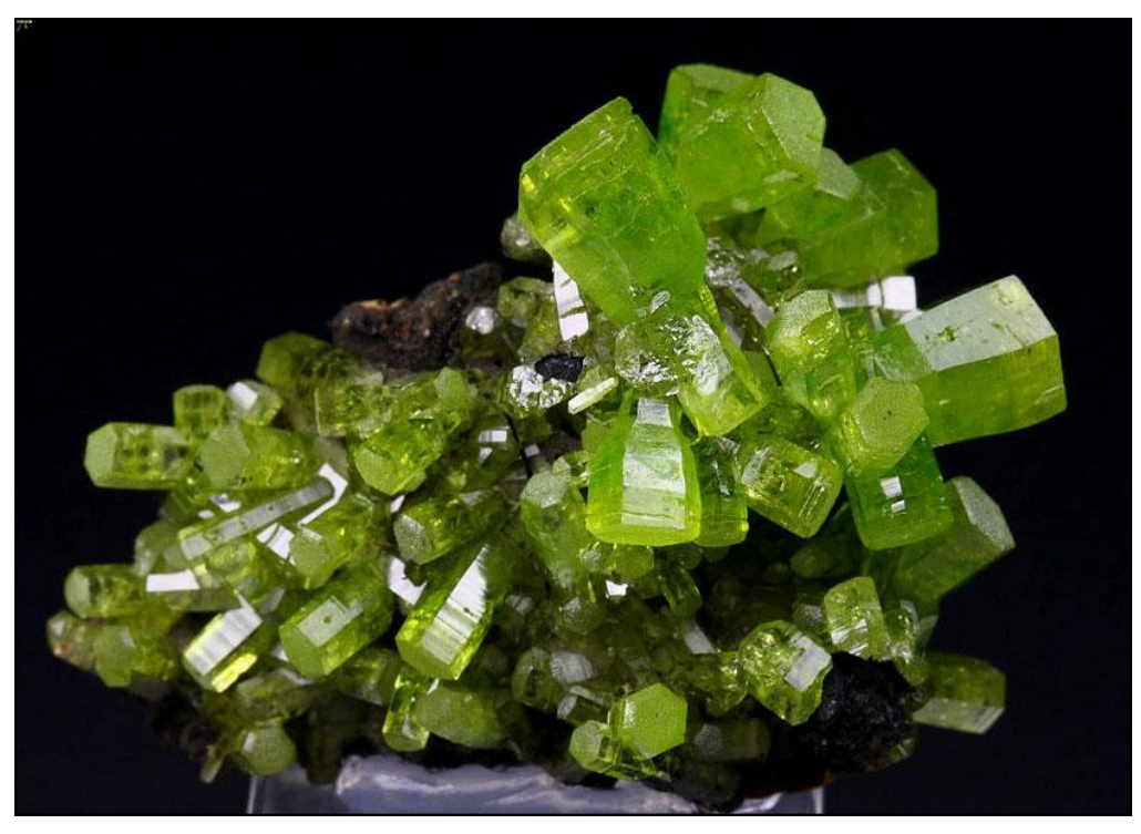
Pyromorphite, 2.6 cm, from the Daoping mine, Guilin, Guangxi Zhuang Autonomous Region, China. Quebul Fine Minerals specimen and photo.

And in my 2013 Denver Show report you will read of a recent very small trickle of new specimens of pyromorphite from the now famous Chinese locality, the Daoping mine, Guilin, Guangxi Zhuang Autonomous Region, with crystals which are not just lustrous and vividly lime-green, as is common for the occurrence, but also are translucent to transparent . So far the only website on which I've located a specimen of this gorgeous stuff is the Quebel website; and here's what the thumbnail in question looks like: