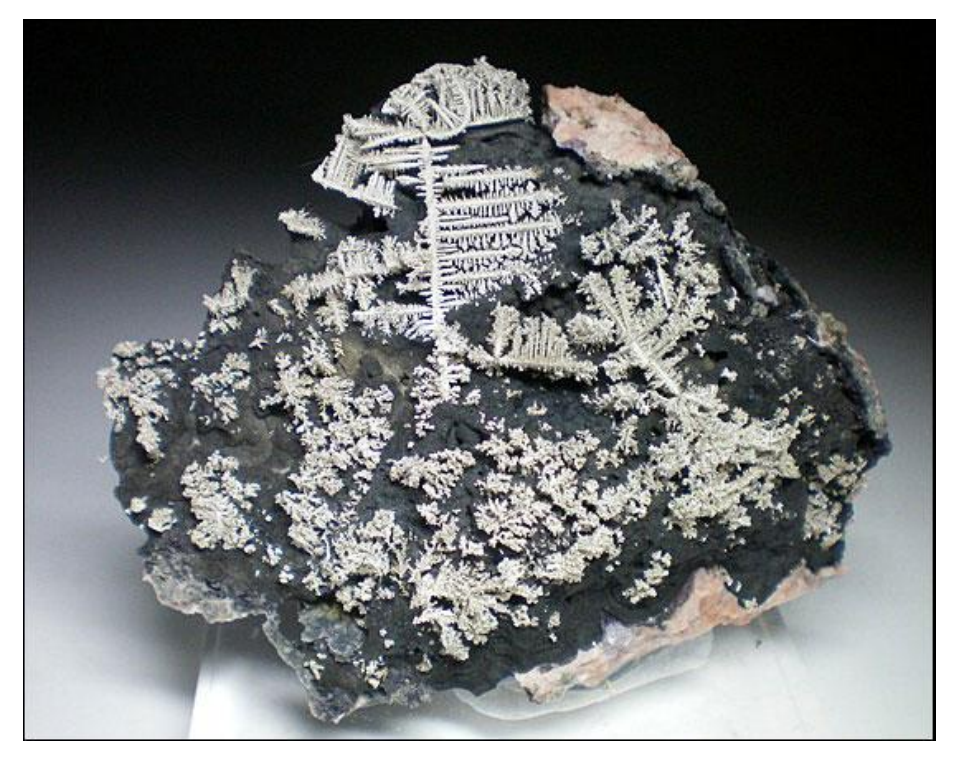
Silver dendrites on native arsenic, 8.1 cm, from the Tellerhäuser mine near Pöhla, Obersachsen, Germany. Trinity Minerals specimen; John Veevaert photo.

Before leaving the Trinity Minerals site, don't forget to scroll through the "back pages," with miscellaneous superb specimens of all kinds arranged in price categories. In the $600-$1000 section, for instance, are three outstanding small-cabinet-size specimens of silver in arsenic from the 1991 find in the Tellerhäuser mine near Pöhla, western Erzgebirge, Upper Saxony, Germany (most dealers mark these specimens "Pöhla mine" but in fact the Tellerhäuser is another small mine southeast of the town of Pöhla, almost on the Czech border). Sharp, bright white dendrites of native silver lie like fallen leaves all over the surfaces of dark gray hunks of native arsenic (the specimens are prepared by etching in oxalic acid), and no other silver ever found anywhere partakes of quite this style of attractiveness. And most of John's other back-page specimens are just as "classic" and classy as that.