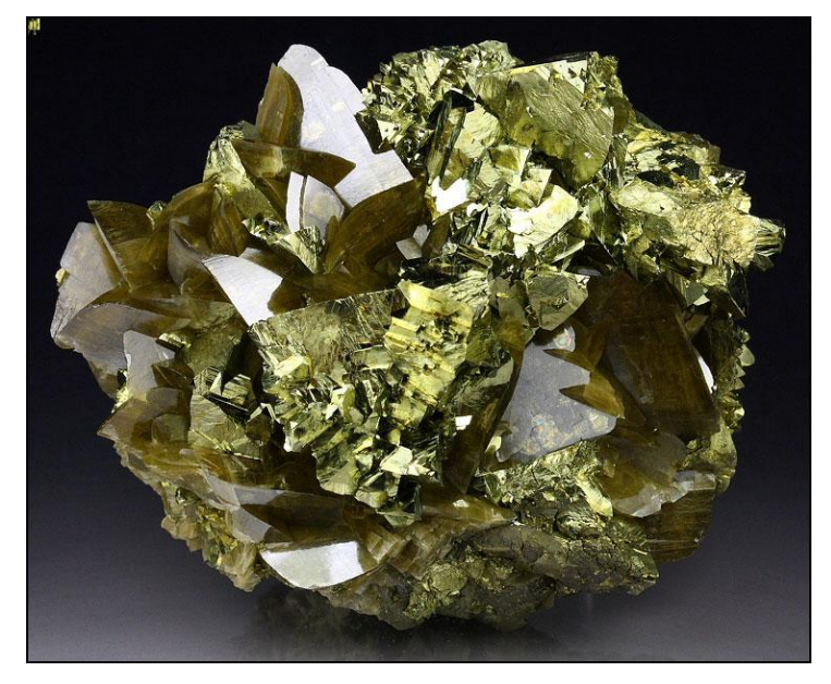
Chalcopyrite and siderite, 6.8 cm, from Hezhang County, Bijie Prefecture, Guizhou Province, China (?).

Also it seems time to show one of the new Chinese specimens of chalcopyrite/siderite , fair numbers of which have been brought to international shows of late, but always with vague—in some cases, conflicting—locality data. The piece shown here has sharp, highly lustrous chalcopyrite and siderite crystals in about a 50:50 ratio, and as such is typical of the material except that it's on the high end of the quality range. According to Quebul the locality is "Hezhang County, Bijie Prefecture, Guizhou Province"—still vague, but that's not Todor's fault; we will just have to keep asking questions until a consensus about the source of these beautiful pieces emerges.