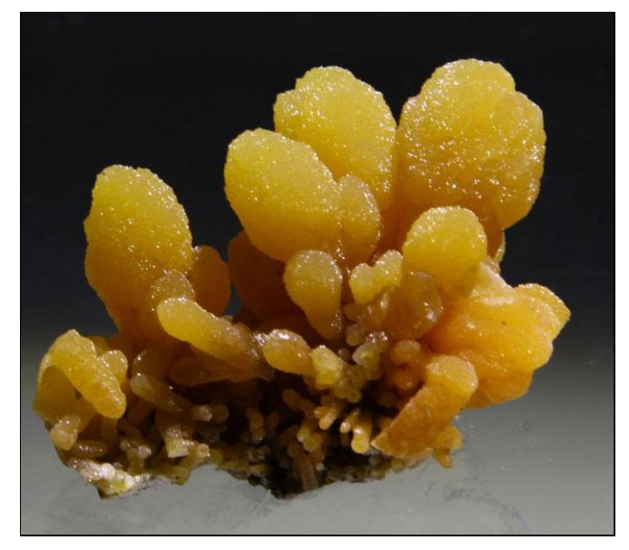
Mimetite, 3.5 cm, from the Ojuela mine, Mapimí, Durango, Mexico. Geokrazy Minerals specimen