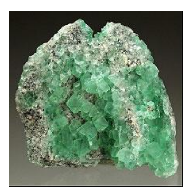
Fluorite, 6.5 cm, from the Berta quarry, El Papiol near Barcelona, Catalunya, Spain.