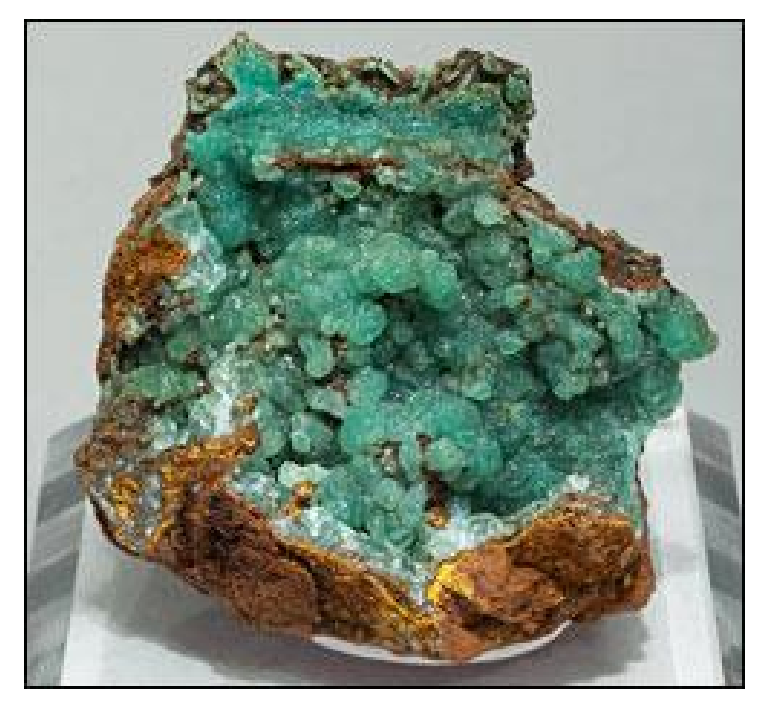
Cu-rich adamite, 5 cm, from the Hilarion mine, Laurium, Attika, Greece. Fabre Minerals specimen and photo.