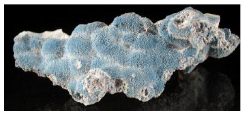
Shattuckite, 13.5 cm, from Anhui Province, China.

Another dealership new to this space is Dave Blakemore's Rough Country Minerals (roughcountryminerals.com), the "rough country" in question being New Zealand, whose minerals are not often seen in the international marketplace. Now being marketed on this site, among other things, are some decent-looking white calcite crystal groups, to 11 cm across, from the Golden Cross mine, Whahi, Coromandel, New Zealand, and some pretty specimens consisting of solid blankets of bright orange-pink stilbite crystals on brown matrix, from Awatere Station, Blenheim, South Island, New Zealand.