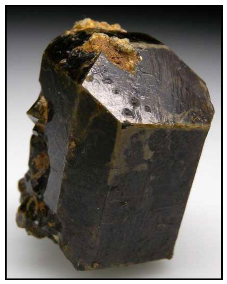
Wiluite, 2.5 cm, from the Vilyui River Basin, Sakha (Yakutia), Siberia, Russia.

nice things from the Merelani mines, e.g. specimens of axinite-(Mg) , bright green tremolite and gemmy green "tsavorite" garnets. And on another recent update Mike shows off some loose, complete, thumbnail-size wiluite crystals from the Vilyui River Basin, eastern Siberia, Russia. If you're still calling these crystals vesuvianite, as was the practice before 1998, when wiluite was distinguished as a new species of the vesuvianite group, well then it's time to get with the program—and maybe pick up one of these elegant little crystals for your collection as well. Why not?—once common around the market, they are getting harder to find.