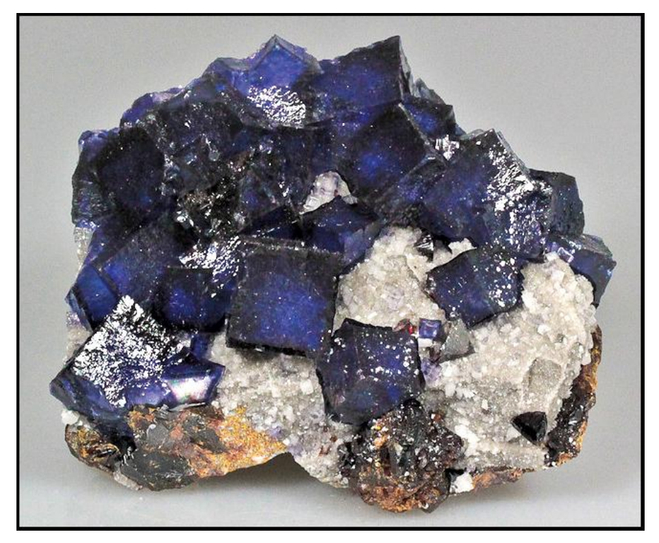
Fluorite, 10 cm, from the Elmwood mine, Smith County, Tennessee. Magma Minerals specimen and photo.

This report concludes with bulletins from three more previously unmentioned called websites. The Dutch dealership Magma Minerals (magmaminerals.smugmug.com) has been offering specimens from the Elmwood mine, Tennessee, and from other mid-U.S. localities for many years. Its latest offerings are especially fine; and besides, really good material from Elmwood is getting scarcer close to "home." As you might infer from the Elmwood fluorite specimen (already sold) pictured here, many of these midwestern U.S. pieces that now find themselves, oddly enough, in the flat, muddy Netherlands, awaiting adoption, are very fine, and there are many more Elmwood pieces where that fluorite came from: see the recent fall updates on the Magma site.