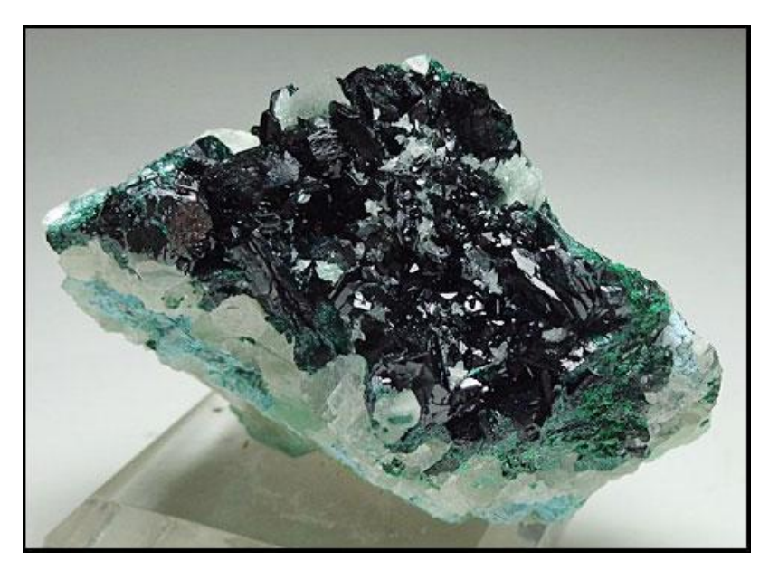
Clinoatacamite, 5.6 cm, from the Lily mine near Pisco, Pisco Province, Ica Department, Peru. Trinity Minerals specimen