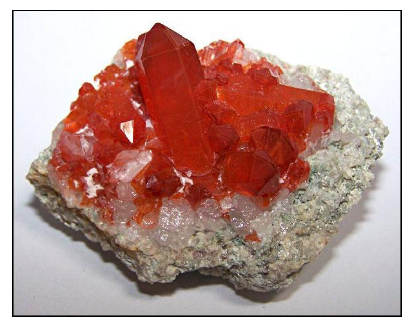
"Orange" quartz on matrix, 6.2 cm, from the Orange River, Northern Cape Province, South Africa. Wright's Rock Shop specimen and photo.