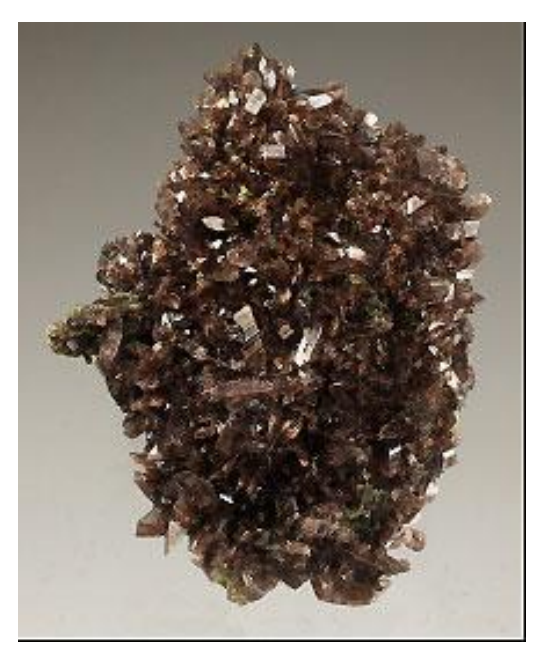
Axinite-(Fe), 6.3 cm, from Sayán, Huaura, Lima Department, Peru.

rich adamite, in the Laurium district has been known since ancient times (literally: these mines may date back as far as 1000 B.C.), but the new pieces are quite fine for the locality.