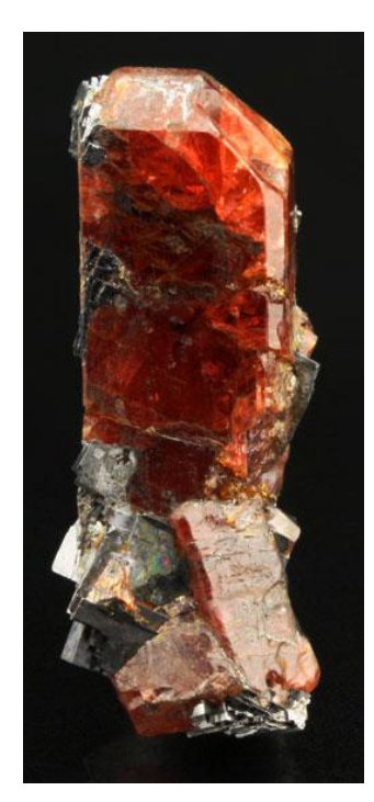
Rhodonite, 3.3 cm, from the Broken Hill mine, New South Wales, Australia. Andy Seibel Minerals specimen and photo.