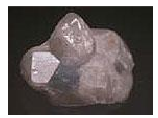
Wollastonite, 3.1 cm, from Wakefield, Outaouais, Quebec, Canada.